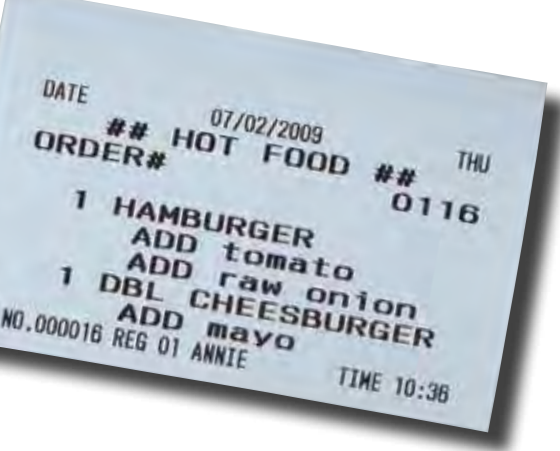
Kitchen requisition printed by the SPS-530 80mm receipt printer shown 75% actual size.