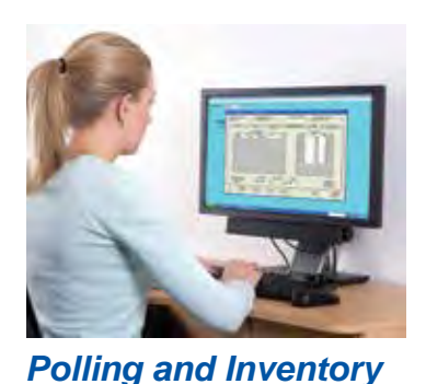
Software Poll your ECR from a local or remote PC using SAM500 or PC/Poll.