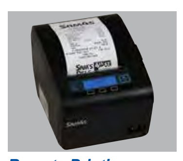
Remote Printing The SAM4s Ellix 40 highspeed thermal printer can print two-color, bar codes and watermarks.